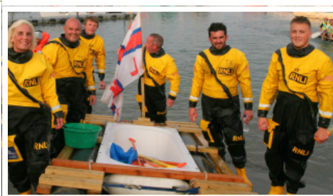
Will it float?